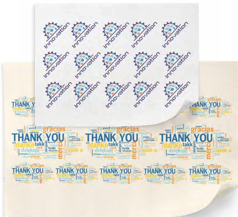
20H x 30W FRENCH VANILLA PAPER TISSUE