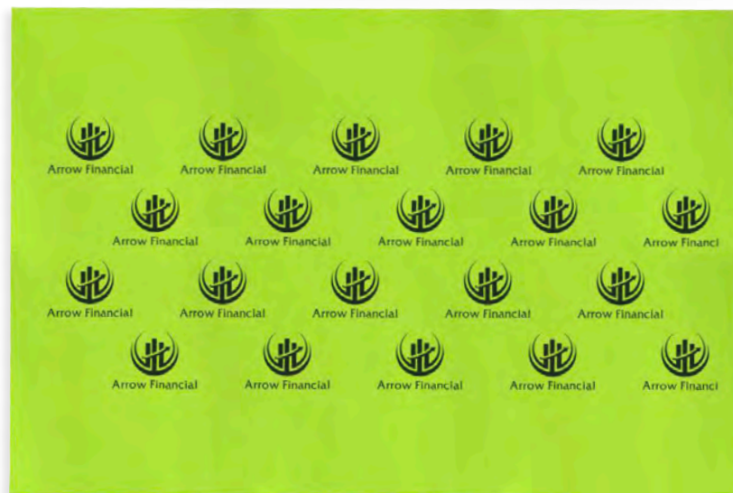
20H x 30W CITRUS GREEN PAPER TISSUE